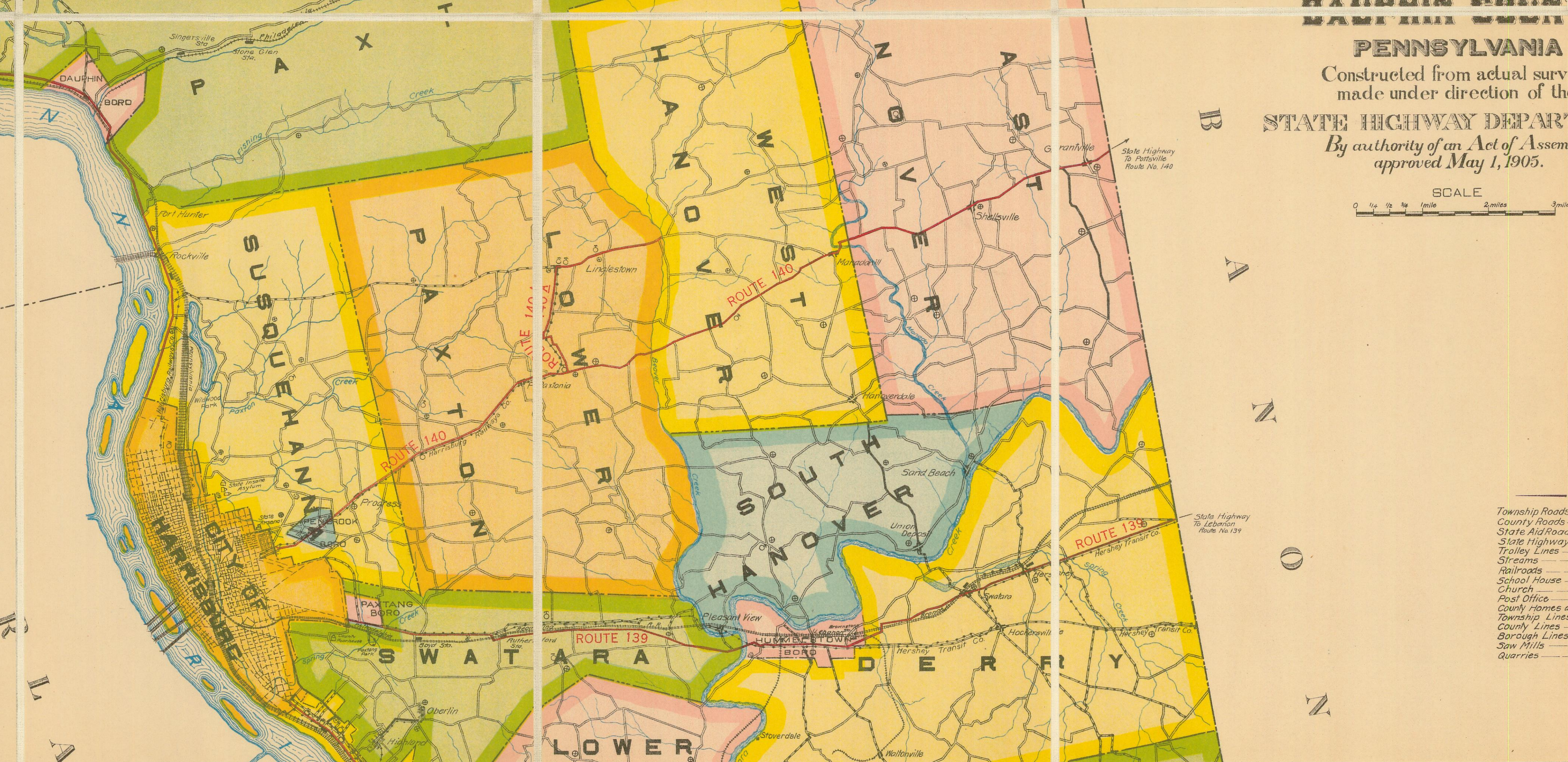
TABLE OF DISTANCES DAUPHIN COUNTY